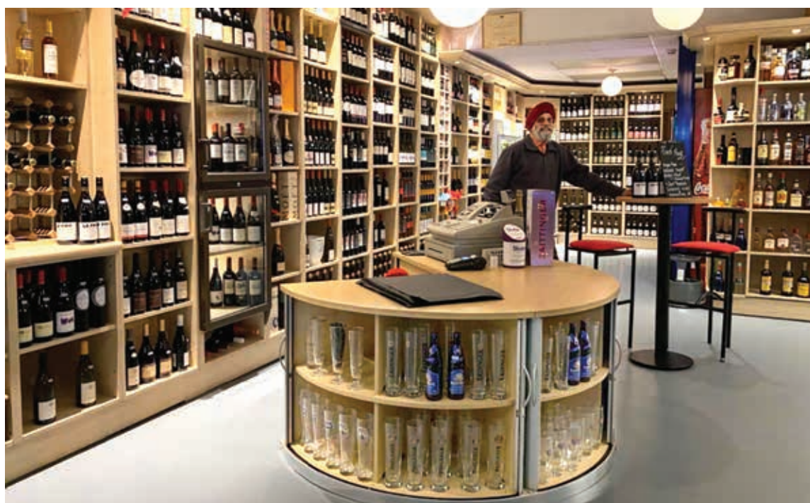
Best cellar: The new interior of the Finchley Wine Store