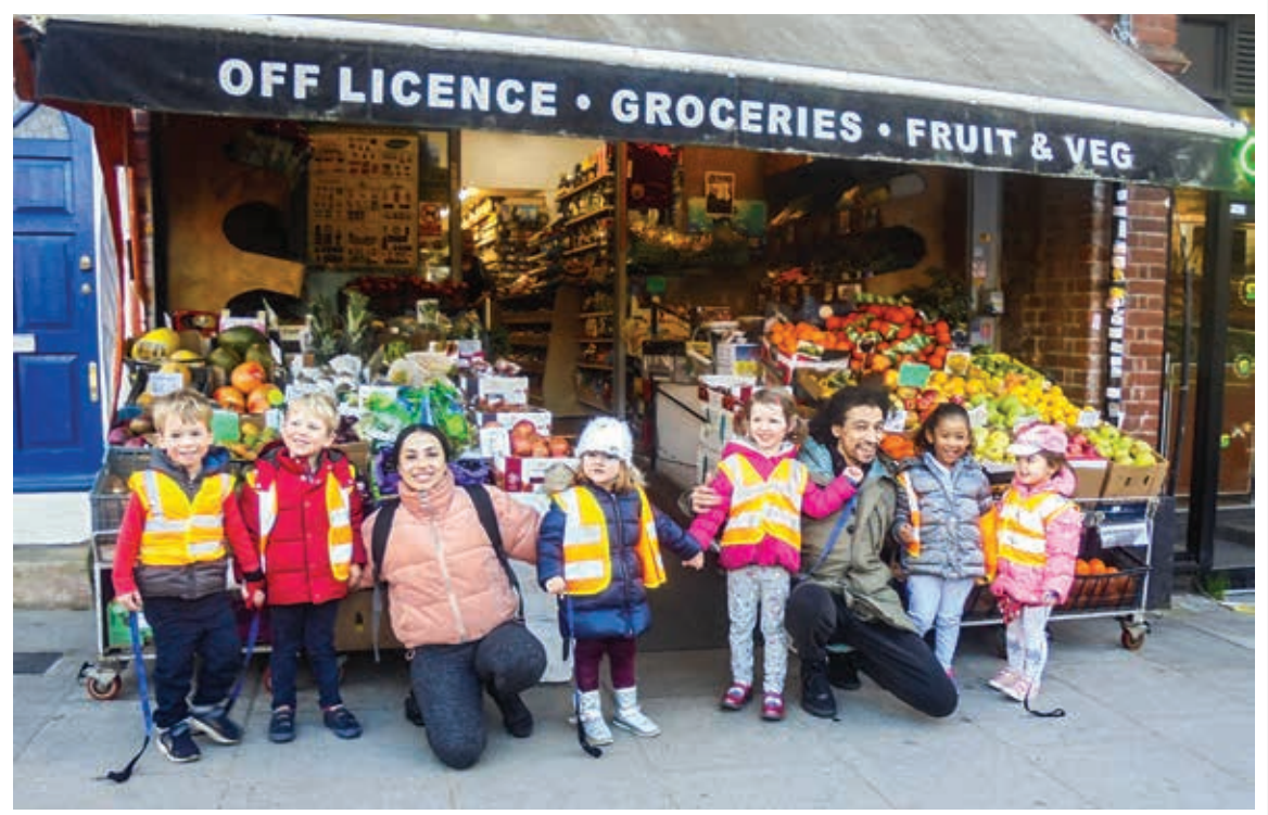
Five-a-day: The Monkey Puzzle children and their carers shop at the N2 Food Centre in the High Road.