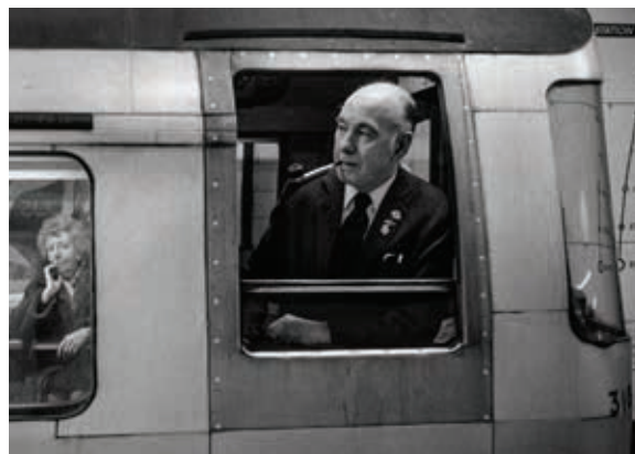
Pipe-smoker: A train guard at Oxford Circus in 1978.

necessary, even in 1970," Mike recalls. "The Tube was dark. Its infrastructure was run down. But not all the changes were positive: beautiful Victorian tile work and lovely decorations around the tunnels and escalator passages were covered up behind aluminium cladding."