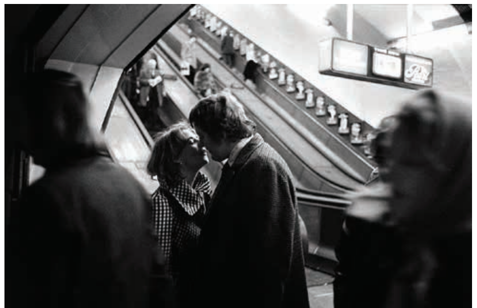
Tunnel of love: A couple kiss at Holborn in 1978.