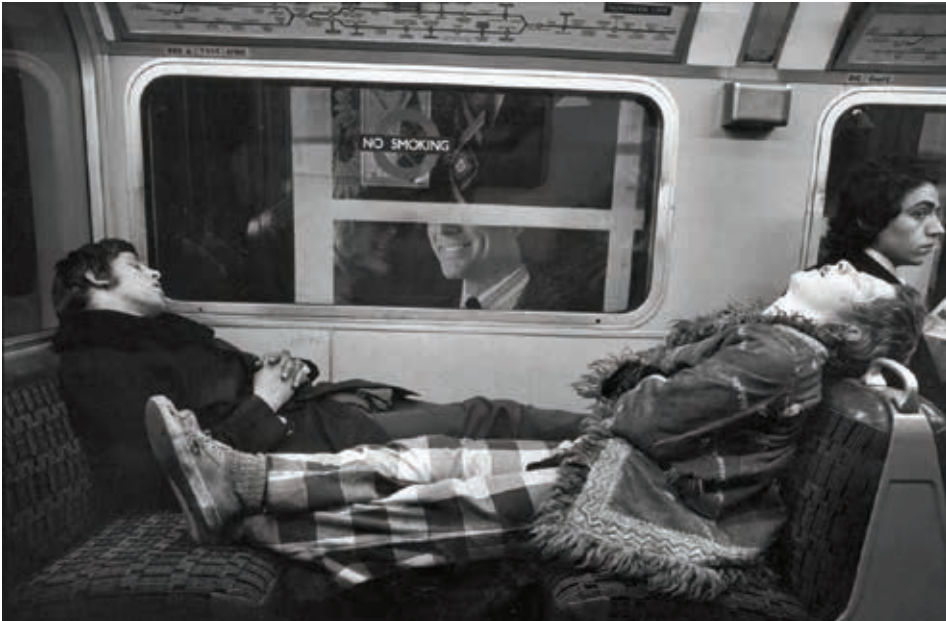
Feet up: Tired travellers on the Northern line in 1975.

If a time machine could whisk today's Tube travellers back to the 1970s, they would be astonished by how different the Underground was back then. Smoking was permitted. The escalators below ground were wooden. Passengers feeling tired (or possibly tipsy) could stretch out full-length on benches situated on platforms.