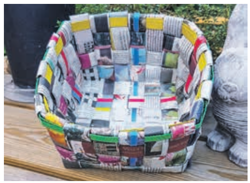
Put to good use: How your paper basket

To make a container all you need is lots of newspaper pages folded neatly into 2-3cm strips