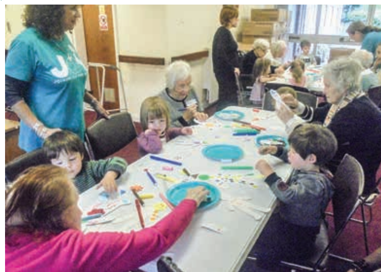
Helping each other: Monkey Puzzle pre-schoolers with residents at Nazareth House.