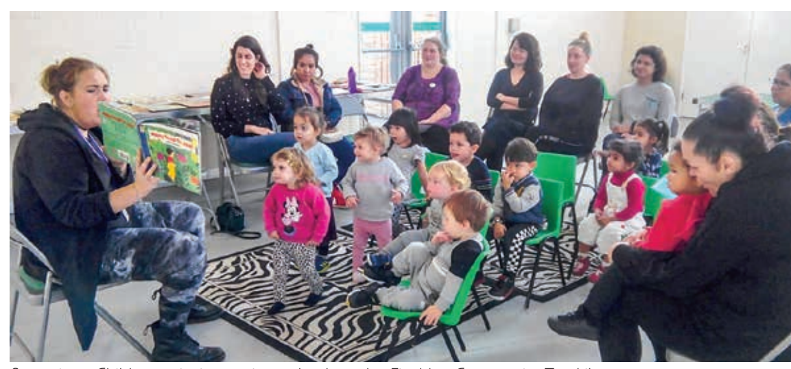
Story time: Children enjoying a picture book at the Finchley Community Toy Library.

These long-serving milkmen have at least succeeded in protecting their rounds for now, so customers' deliveries are safe and these traditional, much-valued small businesses won't disappear ... here, at least. In fact there's been a tsunami of support on social media. One typical comment is: "Let's all try to spread the word and help milk delivery services survive."