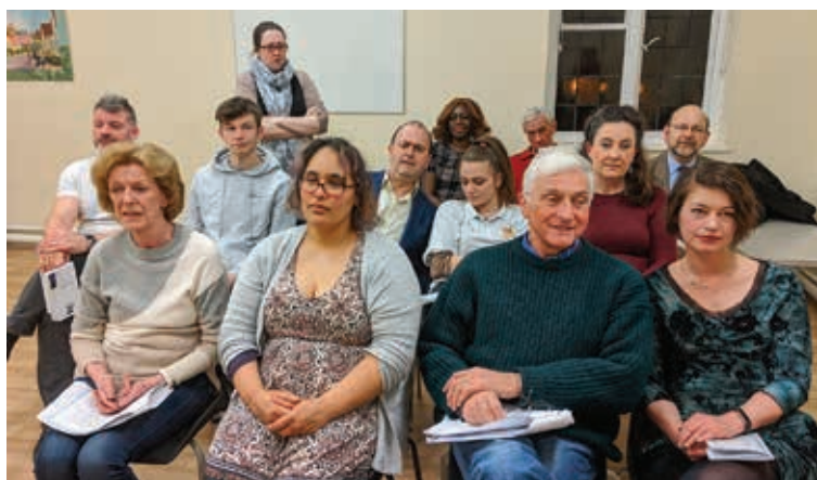
Watching them, watching you: The cast of Audience

A maximum of four poems should be sent for consideration, preferably by email, to n2poetry@outlook.com . Please include your name and contact details. If you are unable to use email, please submit your poems, typed on white A4 paper, to Shereen Abdallah, Managing Editor, N2 Poetry , 3 Leslie Road, N2 8BN. Please include a covering letter and SAE.