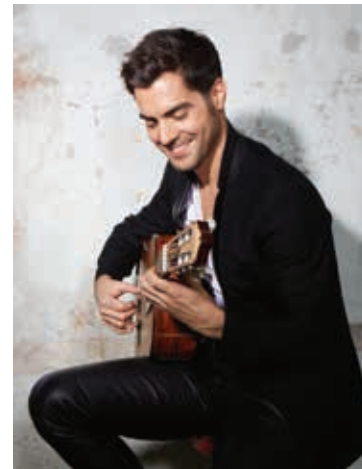
Guitarist: Miloš Karadaglić.