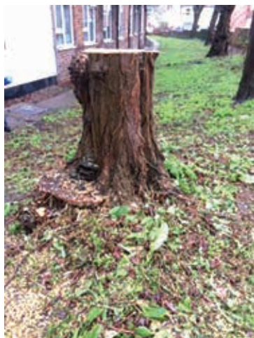
Felled: A chopped tree on the Grange estate.

Yours faithfully Frances Buckingham, Elmfield Road, N2.