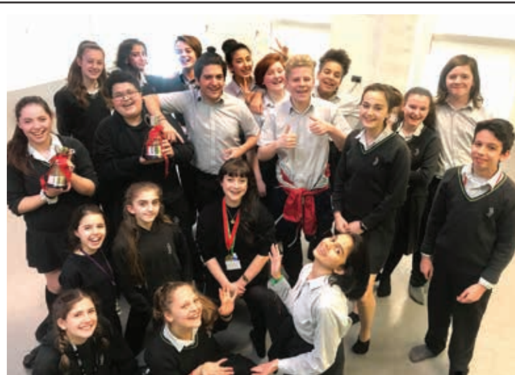
Acting up: Archer Academy students celebrate their win at the Welwyn Garden City Youth Drama Festival.

way as Google but for every 45 searches it plants a tree. It has recently surpassed a milestone of planting over 50 million trees. We are also planning to hold a recycled uniform sale and are thinking of other ways we can all help with climate change.