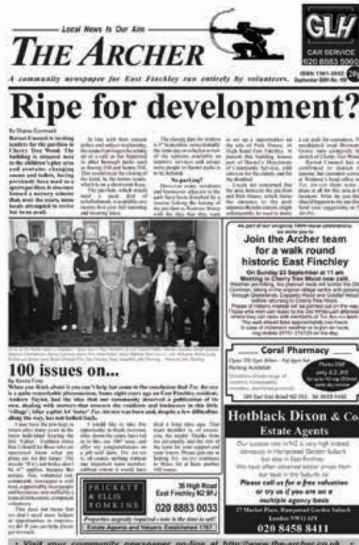
Issue numbers 100 and 200

You can time travel back to East Finchley in any year since 1993 by browsing through the archives on our website www.the-archer.co.uk where you can read all our available editions.