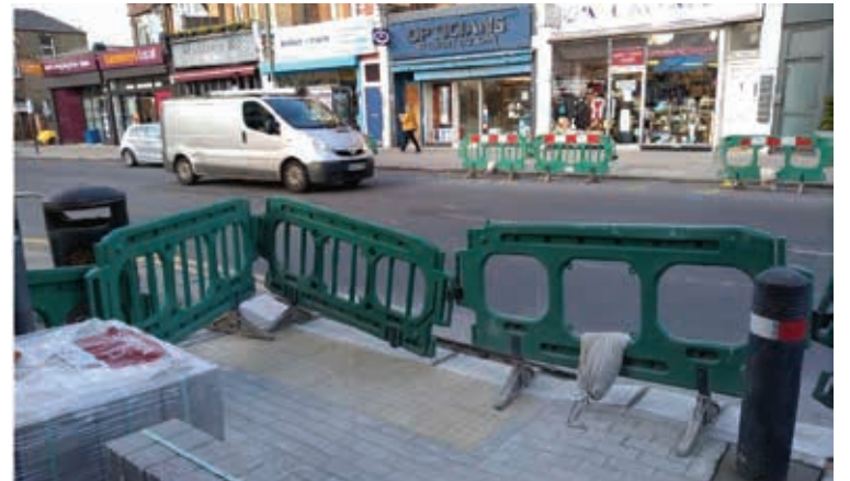
Under construction: Work underway on the new crossing

The fatal collision came after our front page article in last month's edition reporting on calls by staff and parents to improve safety at the pedestrian crossing on the High Road outside Martin Primary School.