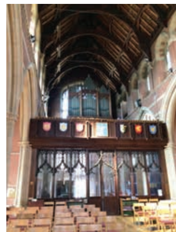
Looking up: The vaulted roof at All Saints.