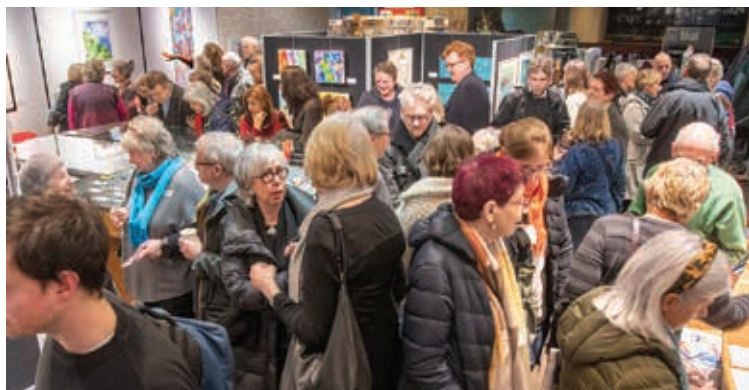
Art lovers at the Private View of East Finchley Open Artists exhibition at the Barbican Library.