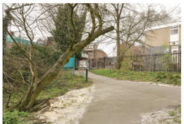
Going, going, gone: Walkers duck beneath the leaning tree at the entrance to Cherry Tree Wood; council workers go in for the chop; the shorn trunks left behind.