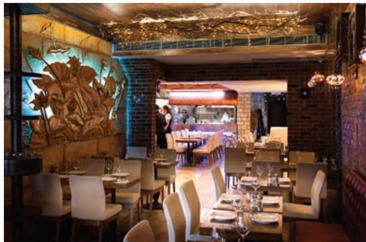
The Meze and Shish restaurant.

Aziz came to England in 1994 from Gaziantep, southern Turkey. Initially he ran a clothing business, but after training at a restaurant in Edgware and elsewhere and opening two Mediterranean vegetable shops, he alighted on Casa Pepe, which was somewhat rundown at the time, and took it over.