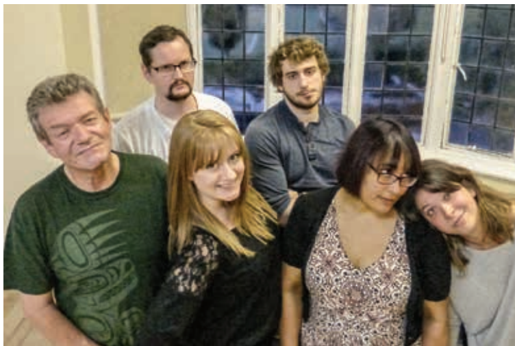
Dinner guests: The cast of Muswell Hill in rehearsal