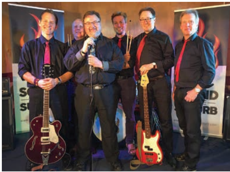
Ready to roll: Sound of the Suburb are returning to Madden's