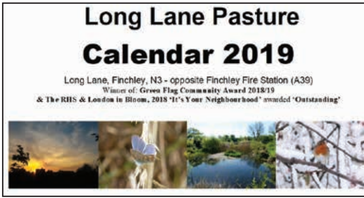
Out now: The Long Lane Pasture calendar

Transport can be provided for those who need it. To book your place, phone 020 8883 0433 and leave your name and a contact number and someone will get back to you.