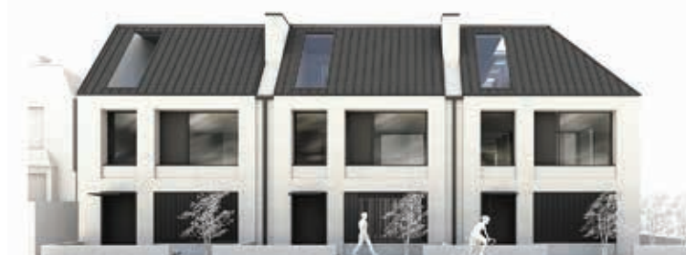
Terraced: The three proposed houses on Leopold Road.

over-dominant or out of place. The terraced houses will chime with existing Leopold Road houses, and the block of flats will blend with the mix of other buildings on the High Road.