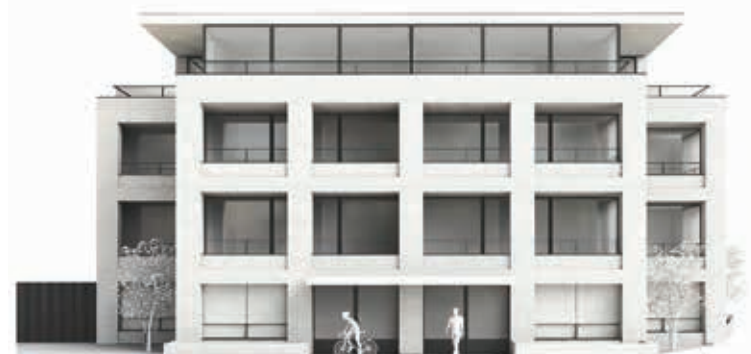
New homes: How the flats would look from the High Road.

Secretary of State James Brokenshire MP allowed the appeal as he considered the buildings would not, in fact, be