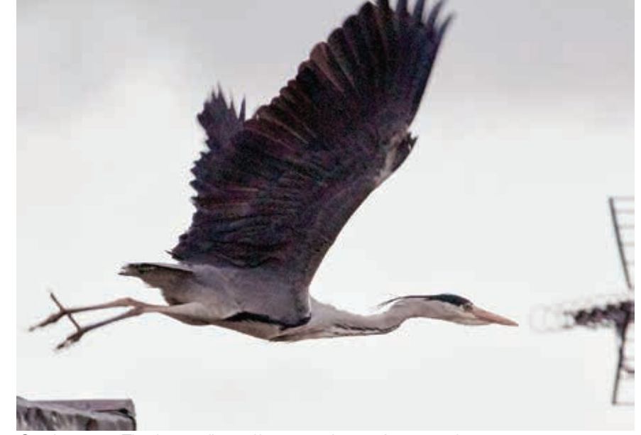
Chris's photo highlights the heron's elegant form. On the wing: The heron flies off among the rooftop aerials.