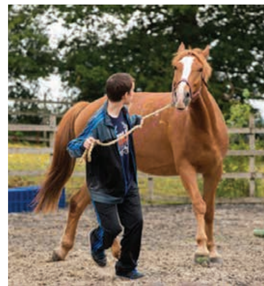
Strength in Horses: one of the projects receiving funding

All Saints' Church, Durham Road, East Finchley Church of England