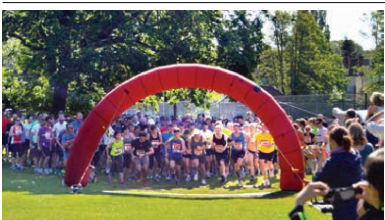
Run for it: Last year's Race the Neighbours gets under way in Cherry Tree Wood

The Archer will of course report any new developments as we get them. East Finchley Open artists continue to have permission from Sainsbury's to make use of the vacant premises with a pop-up photo display.