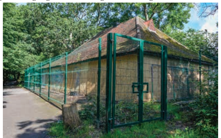
The pavilion, after it was made safe two years ago.

Can we hope for a decision finally to be taken about its fate before this year's East Finchley festival on Sunday 24 June?