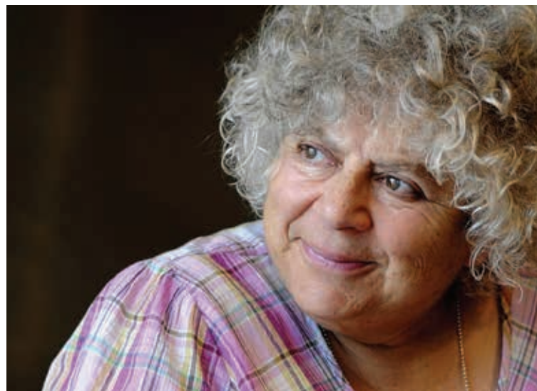
On board: Miriam Margolyes.

See the campaign at https://igg.me/at/Ethel and find out more about the production itself at www.ethelshortfilm.co.uk . Ten per cent of the money raised will be donated to The Bat Foundation, which helps people diagnosed with Alzheimer's through table tennis therapy.