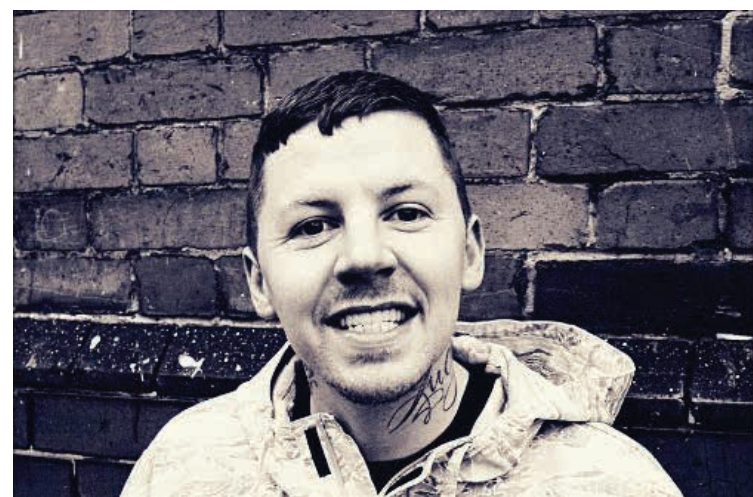
Star cast: Professor Green.

SECUREBASE DOMESTIC COMMERCIAL INDUSTRIAL SECURITY Est 1988