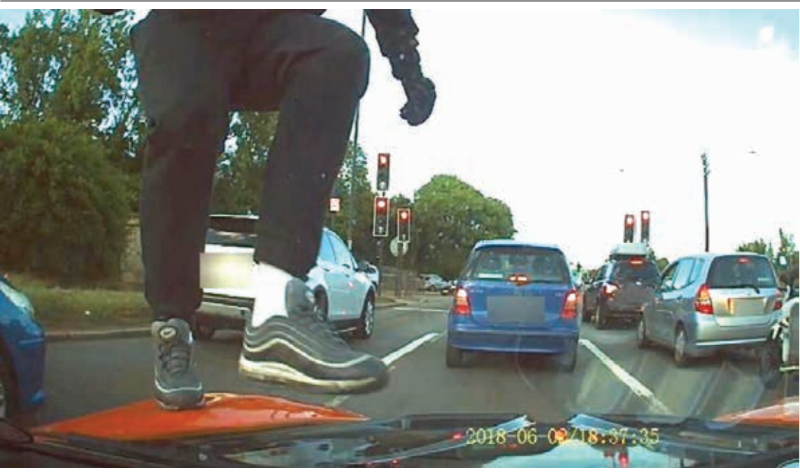
Dashcam footage of the robbery on the North Circular Road

Ten percent of all the shop's sales on the day went towards the cause, too. When the doors were closed at the end of the day and all the coins were counted, Aida was delighted to see that she and her small crew of customer helpers had raised a hefty £615.26. All in a day's work.