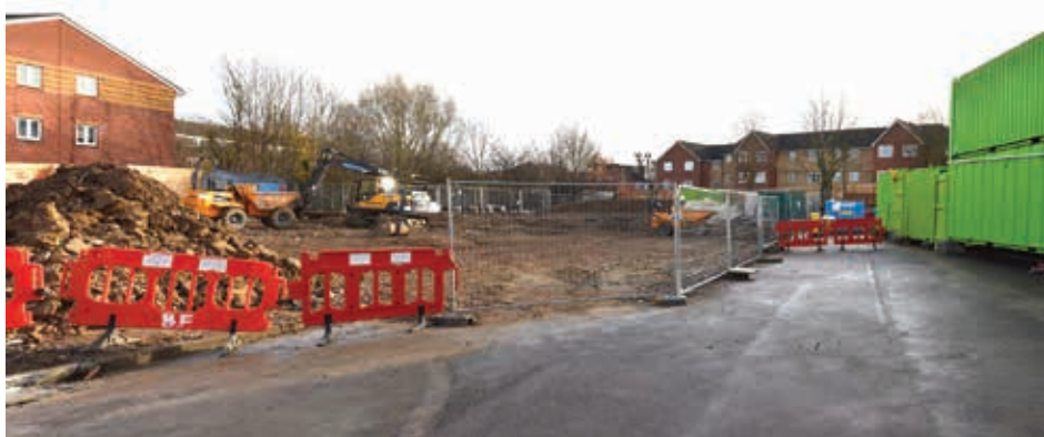
The Old Barn building site in November.