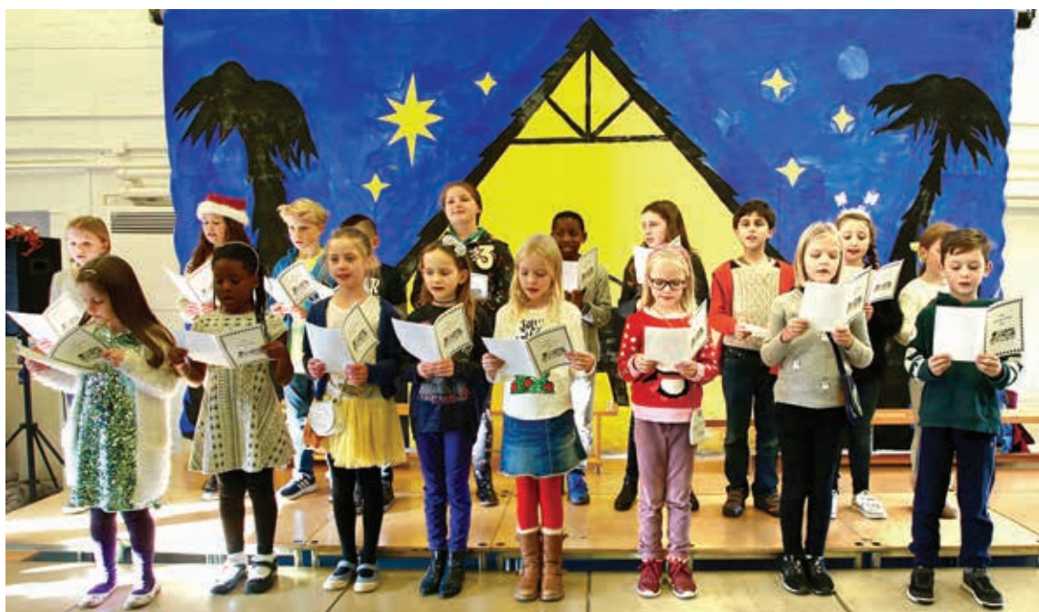
Young voices: The Holy Trinity Choir sings at the school's fair.

http://www.allsaints-eastfinchley.org.uk