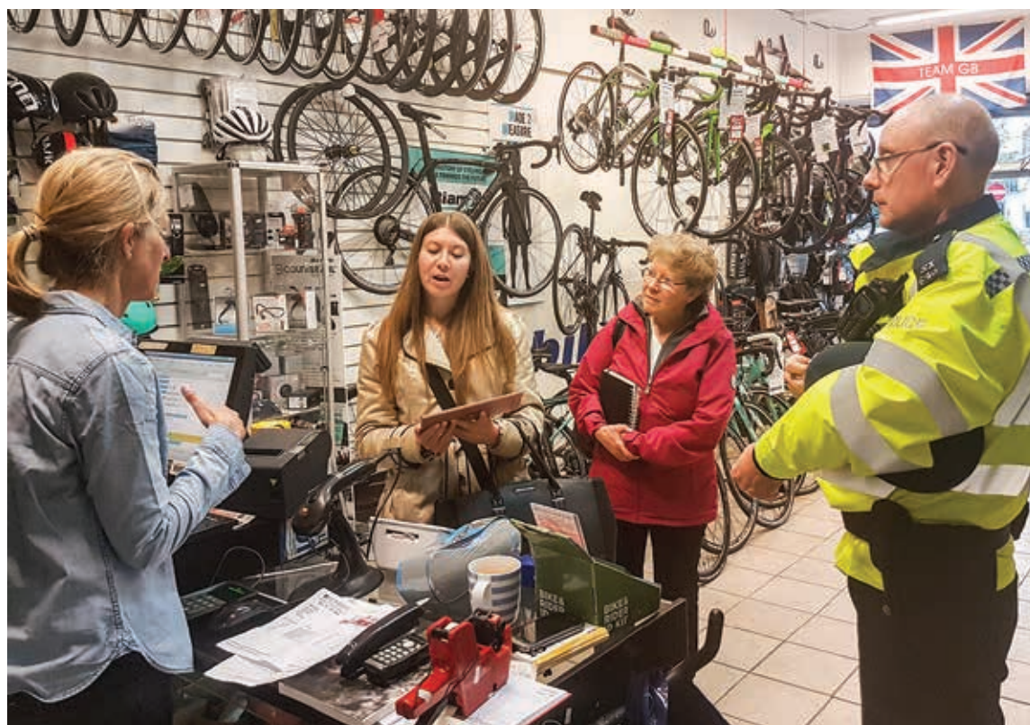
Counter measures: The digital security team visiting Bike and Run.