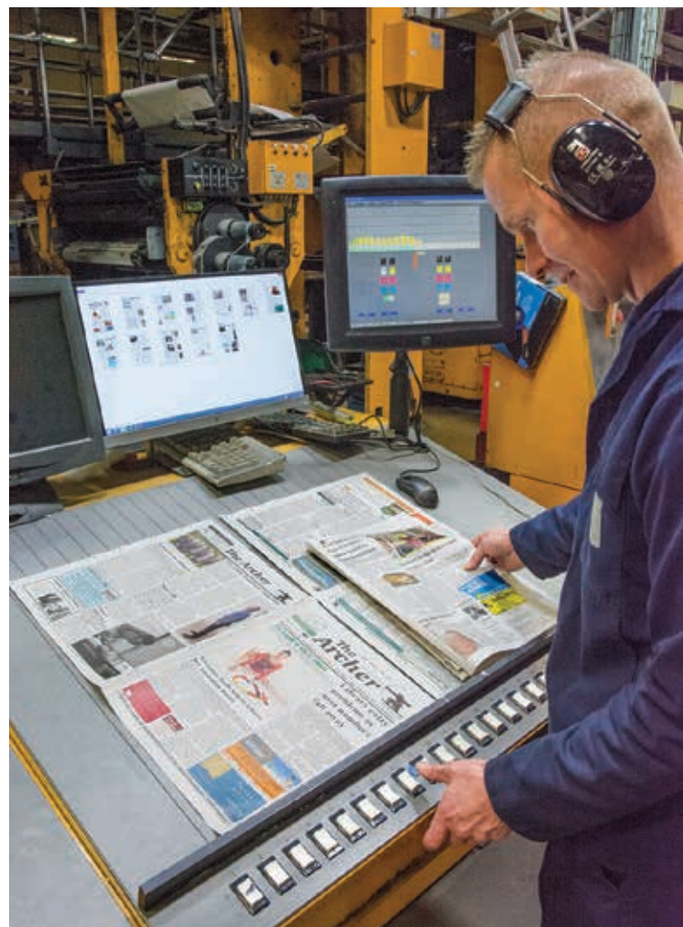
Hot off the press: Papers are checked as they come off the line.

a healthy future for printing but a lot more of our business is digital and on demand, so we have to be set up to handle shorter runs with quick turn-round times."