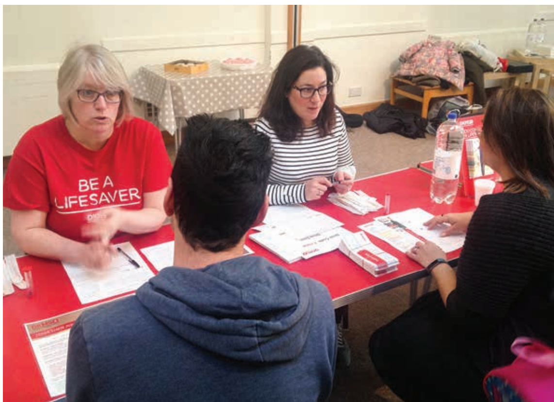
Life savers: Volunteers registering two potential donors in Muswell Hill.

Almar Business Solutions Limited is a registered company in England and Wales (registered number 04541322), holder of ACCA Practising Certificate with Association of Chartered Certified Accountants and has Professional Indemnity Cover for its business activities.