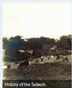
History of the Suburb

HOME MUSEUM GUIDE BROWSE ABOUT HGS HERITAGE CONTACT DETAILS