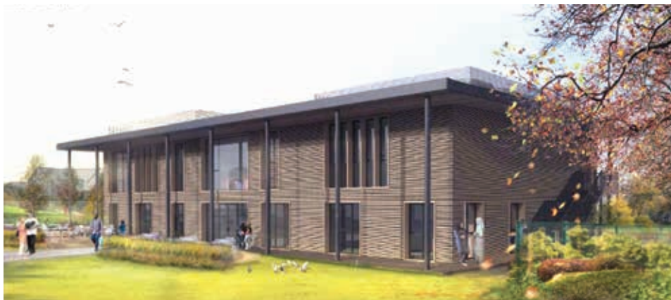
How the new community centre might look when it's finished