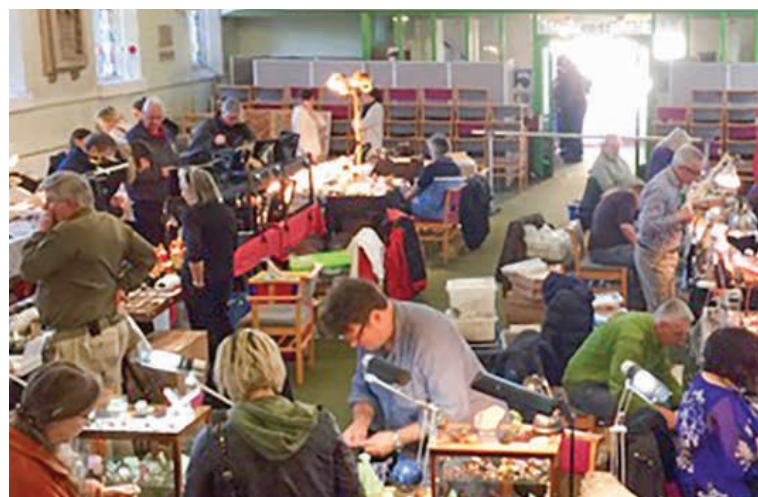
Fossils for sale: Enthusiasts browse the stalls at the Mineral, Gem and Fossil Show.