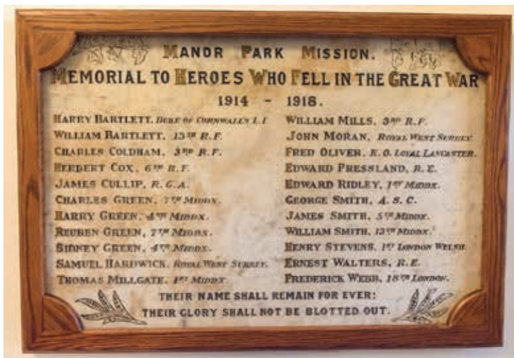
The war memorial plaque now restored to East Finchley library.