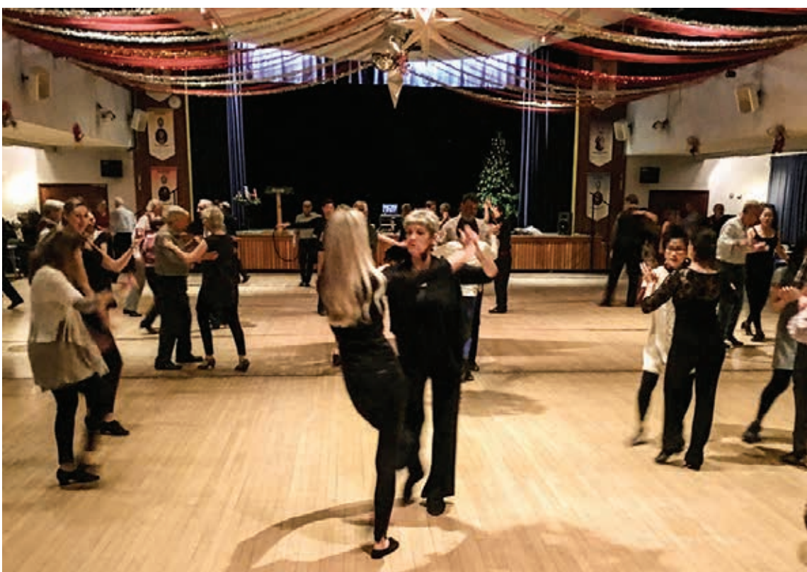
In step: Dancers practise at the Bishop Douglass club.