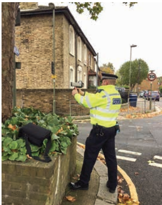
Take aim: A police officer monitors driving speeds on Church Lane.