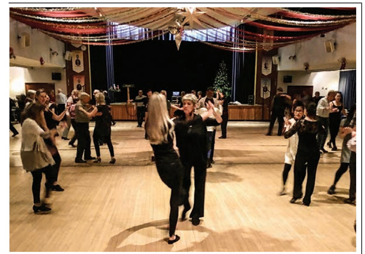
In step: Dancers practise at the Bishop Douglass club.