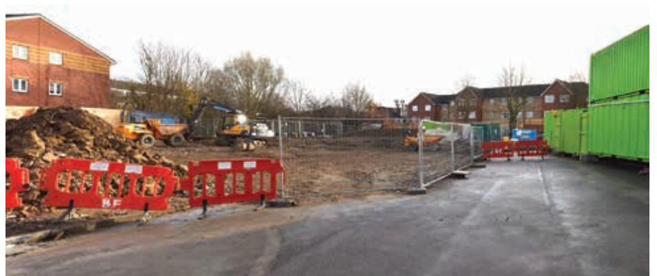
The Old Barn building site in November.