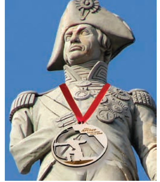
Search is on for the oldest business in East Finchley