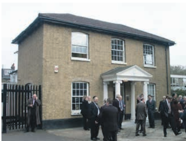
Valona House, pictured in 2005

This means that the controversial redevelopment of the site on 12-18 High Road (the demolition of Valona House and its replacement with 21 flats