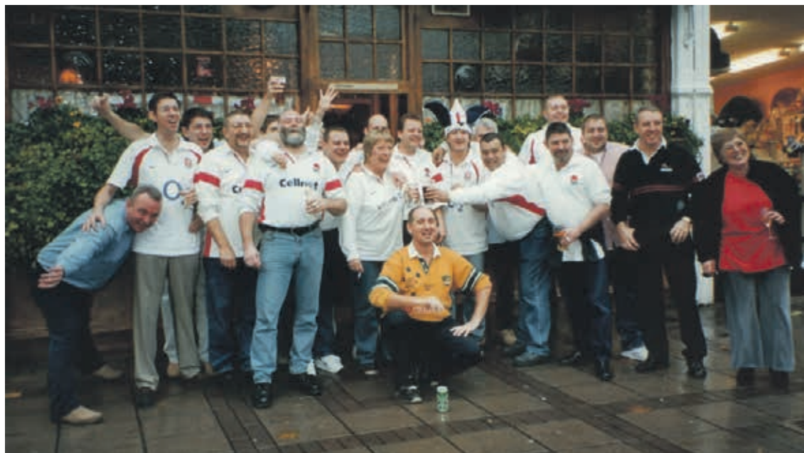
England rugby fans (and one lone Aussie) outside Maddens during the 2003 World Cup (see Many Happy Memories, right).