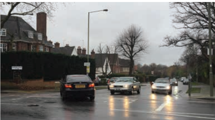
Turning point: A driver waits to turn right out of The Bishops Avenue as another car leaving the Great North Road crosses his path

The Archer asked Barnet Council for an update on their proposal, first reported last autumn, to install a pedestrian crossing at the junction with The Bishops Avenue and the High Road, N2, and to ban the right-hand turn into the High Road at that point.