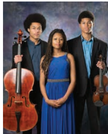
Young musicians: The Kanneh-Mason Piano Trio

Proms at St Jude's is run almost entirely by volunteers, with all surplus going to charity. It runs from 23 June to 1 July,