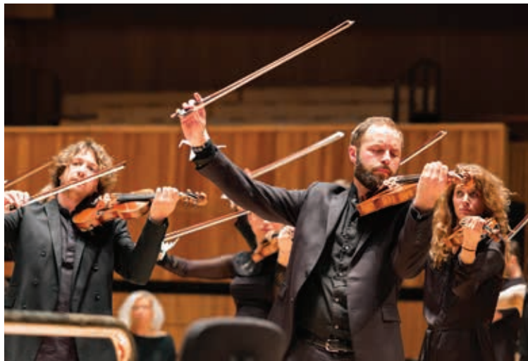
Playing from memory: The Aurora Orchestra.

at St Jude's Church, Central Square, NW11 7AH. Tickets go on sale from 23 April, but you can get priority booking earlier by becoming a Friend. More details at www.promsatstjudes.org.uk .