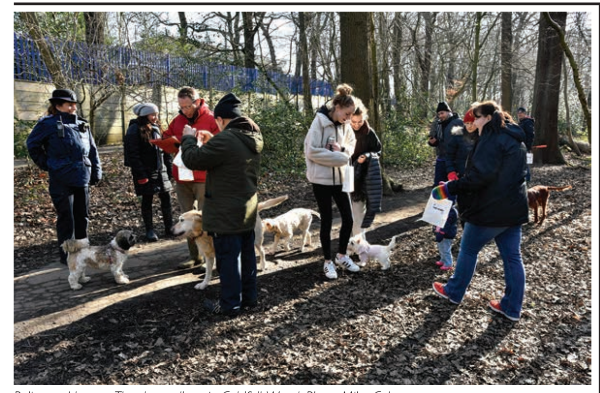
Police and leaves: The dog walkers in Coldfall Wood.