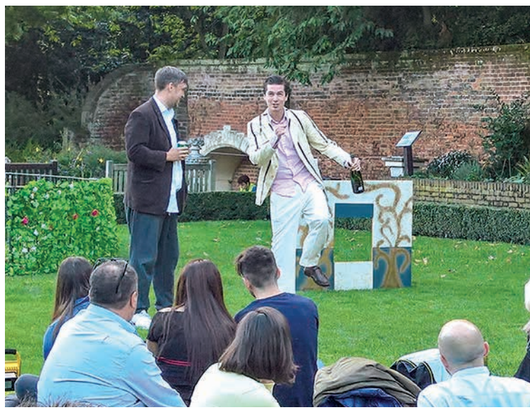
The Shooting Stars Theatre Company production of Twelfth Night on the lawn at Lauderdale House.