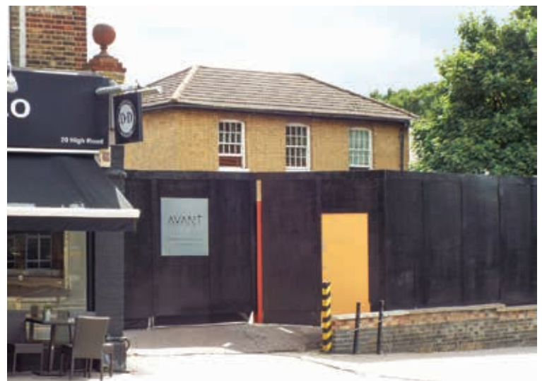
Fenced off: Valona House as it looked in August

The Archer understands that if alterations are made to comply with Building Regulations, then another planning application should be made.