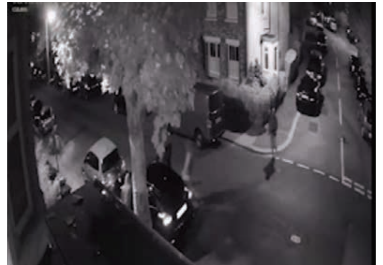
A CCTV grab of the incident in Long Lane

Police have released CCTV footage in an appeal for witnesses to a robbery on Long Lane by a gang of men who sprayed their victims with a 'noxious substance'.