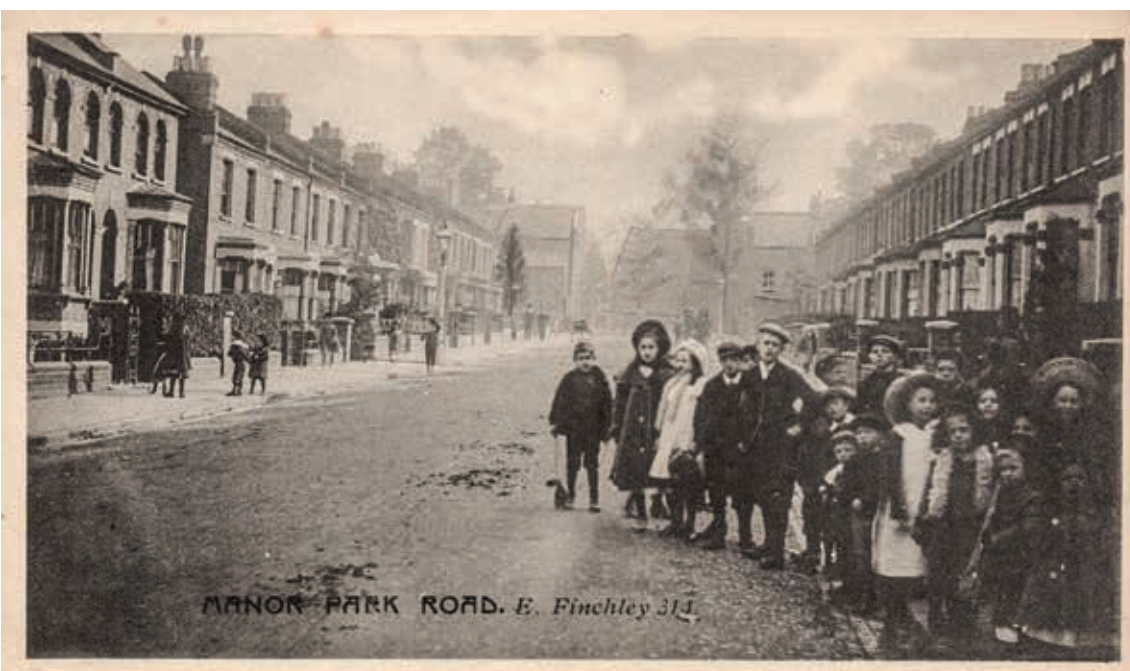
Our manor: Children of Manor Park Road around 1900, above, and in 2017.