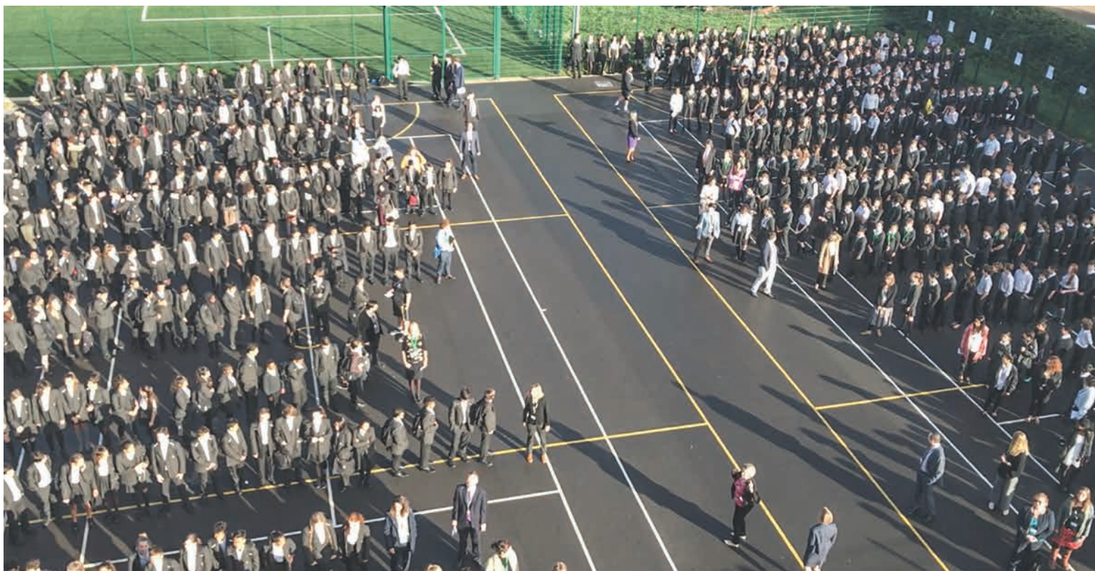
Class action: The students of all seven years at the Archer Academy line up on the school's hard courts off Eagans Close.