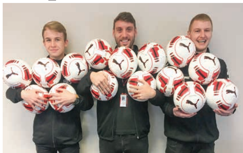
Right: Balls up: The Soccer-sixes team get ready with their giveaways

Teams play every Monday and Thursday at Christ's College, off East End Road. Eleven-a-side teams are welcome to enter six-a-side groups if they want extra training. Find out more at www.soccersixes.net .