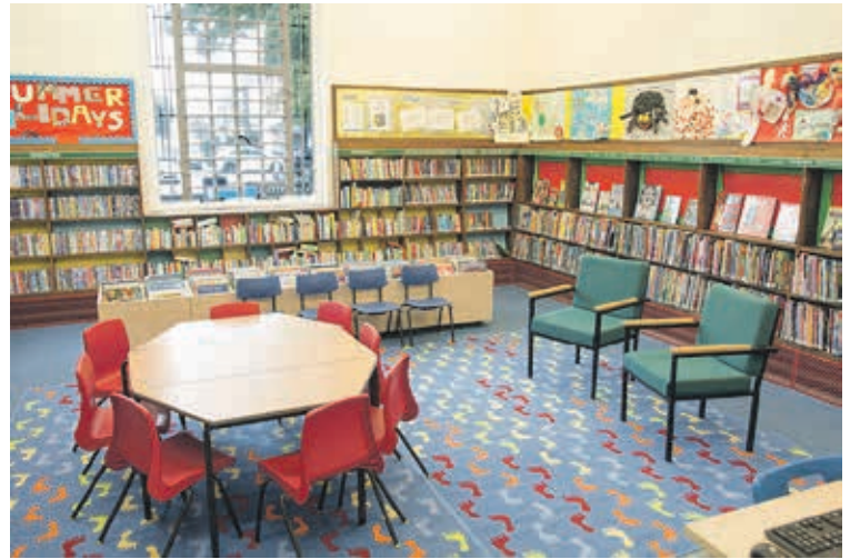
The children's library - ready to go.

We have heard of one person who has found this did not work. Has anyone else had the same problem?