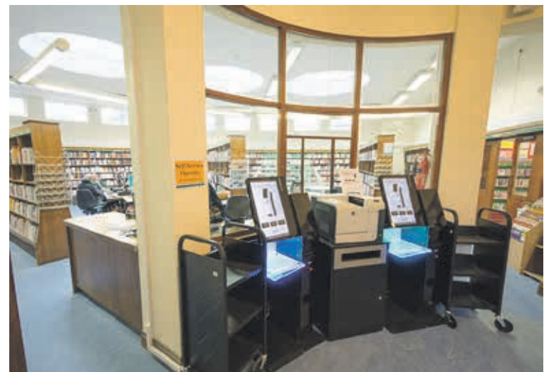
Automated: The library entrance.

What do you feel about the re-opened library? Email us at the-archer@lineone.net or write to The Archer, PO Box 3699, London N2 2DE. Here are some of the reactions we've had so far: