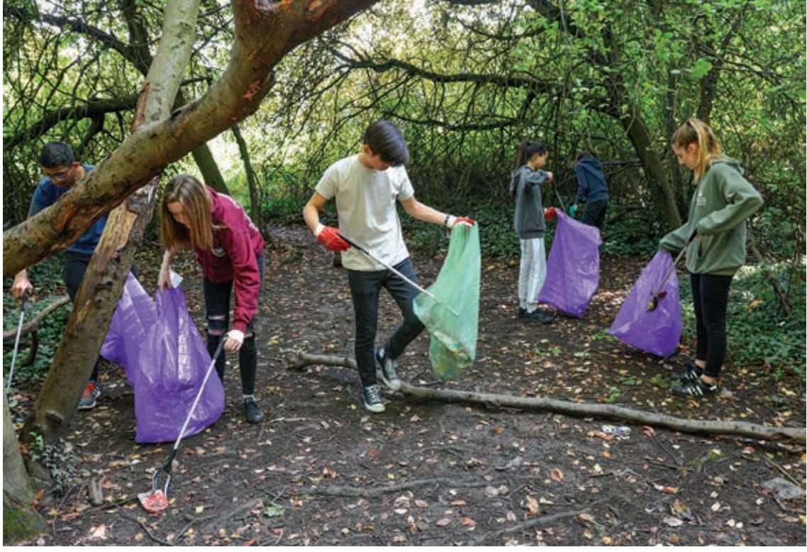
Bag it up: The NCS group at work in the undergrowth.

This type of offence can be hard to spot but it can be prevented. Always check that your car is actually locked after you have zapped it and walked to the bedroom where he found tailgating you into any car park.