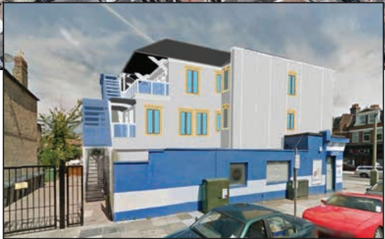
The proposed redevelopment of 127 - 133 High Rd viewed from above and from Kitchener Road