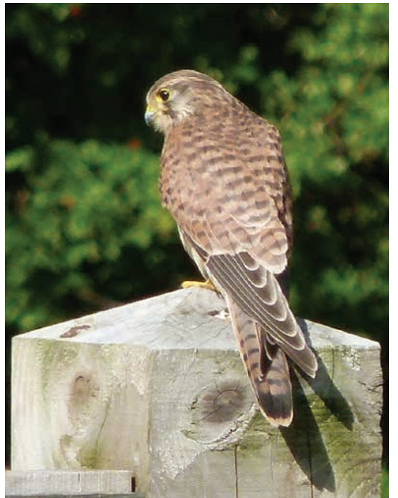
Let us prey: The kestrel on the hunt in Long Lane Pasture.

Cree Godfrey & Wood 28 High Road East Finchley London N2 9PJ T: 0208 883 9414 F: 0208 444 5414 W: www.creegodfreyandwood.co.uk Email: gn@cgwsolicitors.co.uk