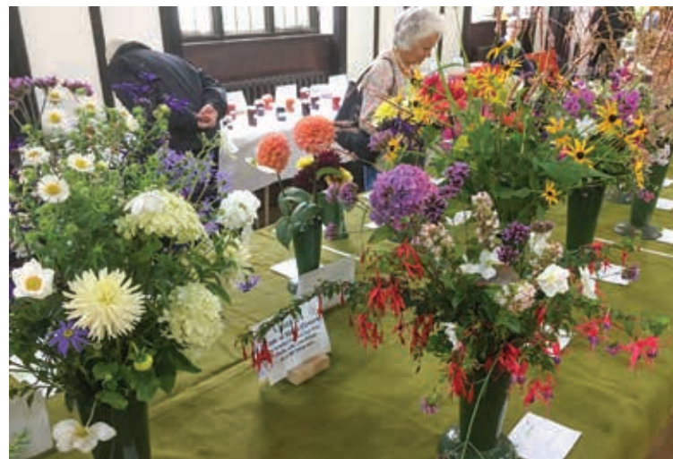
Petal power: The beautiful floral display at the Garden Suburb show

On Saturday 9 September the Free Church Hall in Hampstead Garden Suburb was transformed into a green oasis by a cornucopia of floral and vegetable delights at the 284th flower show of the Hampstead Garden Suburb Horticultural Society.