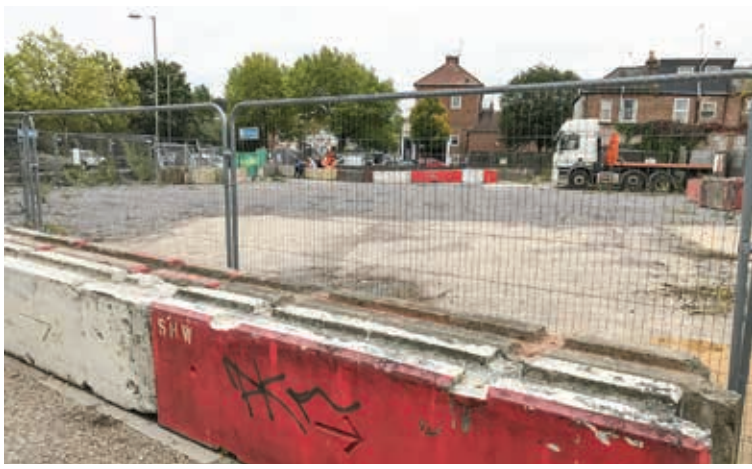
The new concrete barriers at the old Esso garage