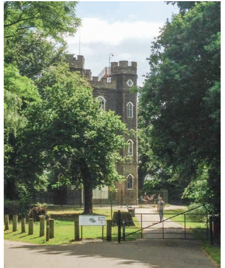
Turrets in the trees: The walk passes Severndroog Castle south of Woolwich.

So if you're up for a long-term walking challenge, why not follow the green signs? What with one thing or another, I managed to finish it in just under two years! The TfL website has plenty of information about each of the 15 sections: https://tfl.gov.uk/modes/walking/capital-ring .