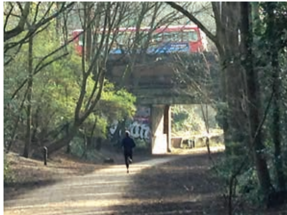
Arch-way: The walk follows the disused railway line to Finsbury Park.

Officially it starts and ends at Woolwich, but would-be walkers can start anywhere along its length. It is divided up into 15 sections, each of which has public transport links at the start and the finish; East Finchley is part-way along section 11 which runs between Hendon and Highgate.