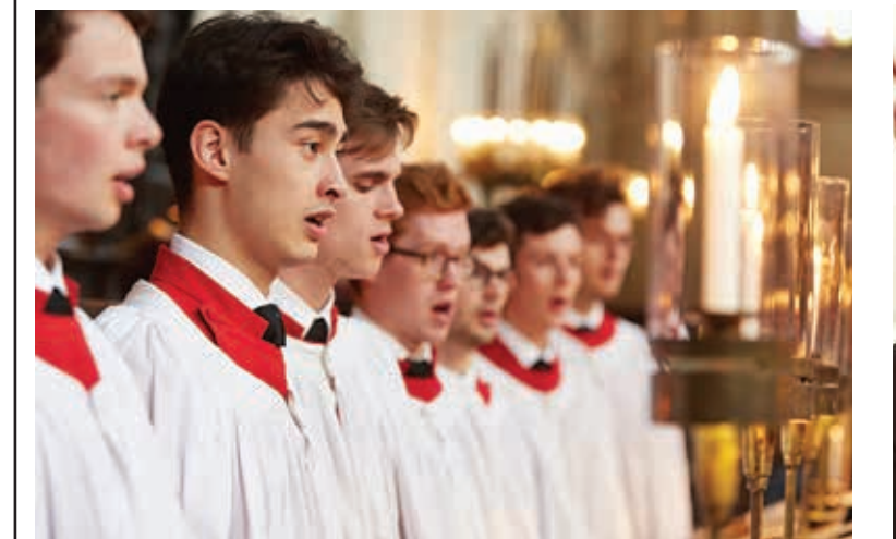
Proms singers: The Choir of King's College, Cambridge.

Contact hospice fundraisers on 020 8449 8877 or email fundraising@noahsarkhospice. org.uk for a supporters' pack.