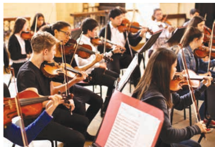
Melody makers: young performers at the Youth Music Centre

from 6pm to 7.30pm. To book a ticket for the show or to book a free taster session phone 07708 608 570 or email info@fixationtheatre.com .