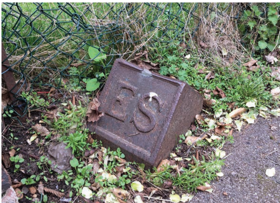
Mystery object: The metal plinth in Pumphandle Path.

On that website, you can also report crime and anti-social behaviour, apply or register for things like charity collection licences, request vital information, such as collision reports, and read the latest crime prevention advice.