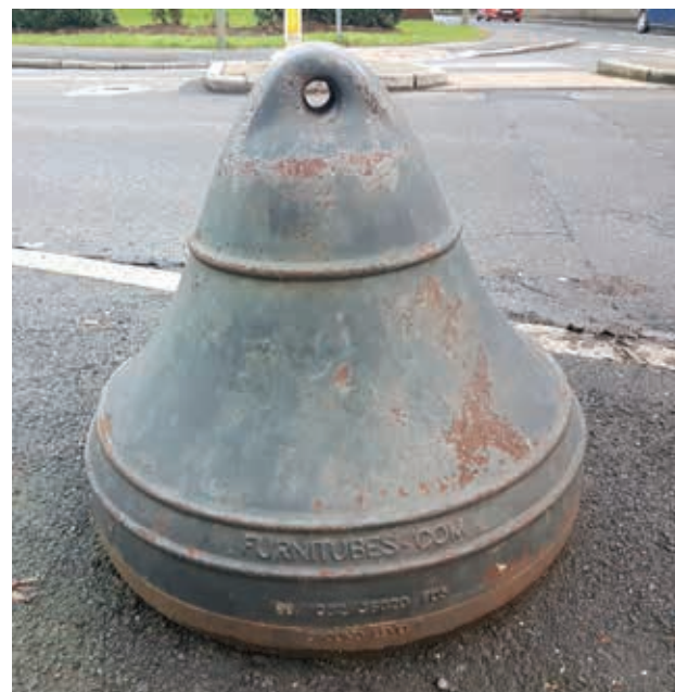
Bulbous: The bollard

Have you seen an object around East Finchley that you are curious about? Send us a letter and a photo if possible to The Archer , PO Box 3699, London N2 2DE or email the-archer@lineone.net , and we'll see if readers can help shed light on it.