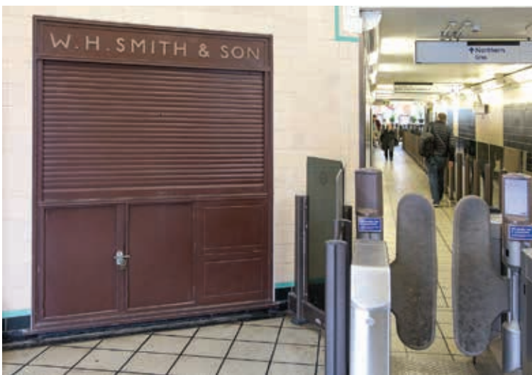
The old WH Smith kiosk at East Finchley station.