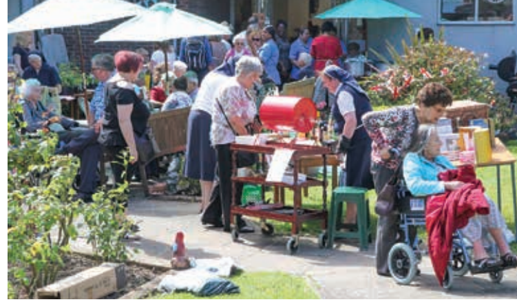
Garden party: Visitors throng the Nazareth House summer fair.