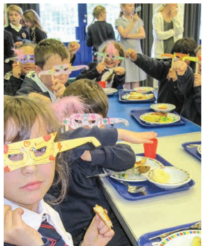
Super healthy: Holy Trinity pupils tuck in while wearing their hero masks.