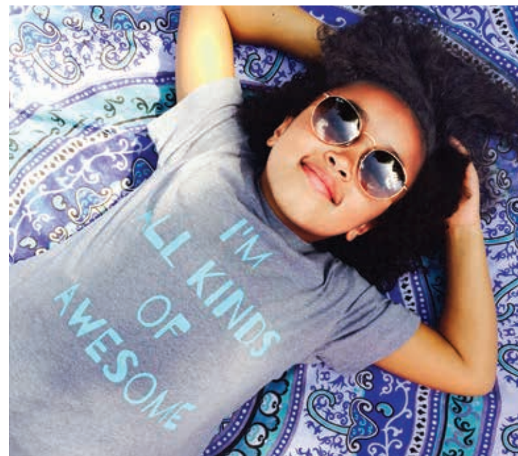
Get the message: One of I'More's T-shirts.

I'More Kids clothes are currently being stocked at Ryker Kids in the High Road, N2. Find out more at www.imorekids.bigcartel.com .