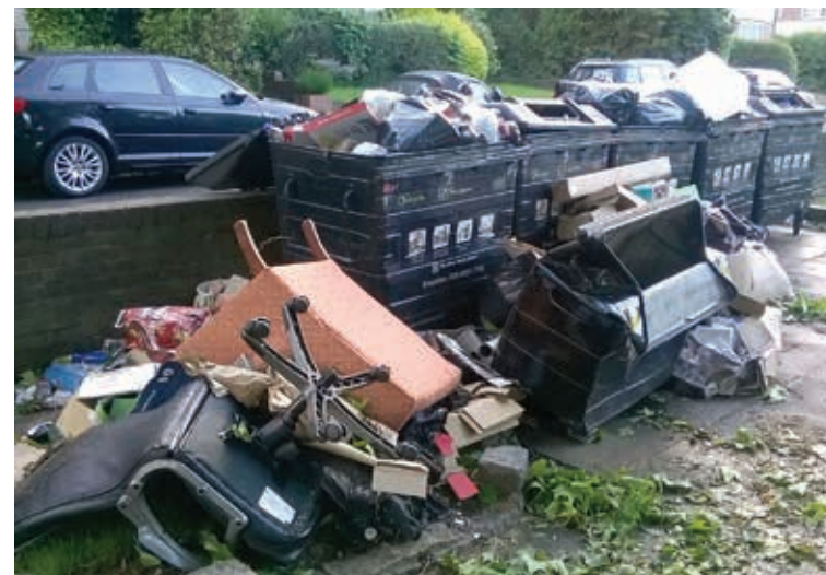
Health hazard: Flytipping on the Great North Road.

Single-storey rear infill extension. Extension to existing rear outbuilding. Additional outbuilding, replacing shed.