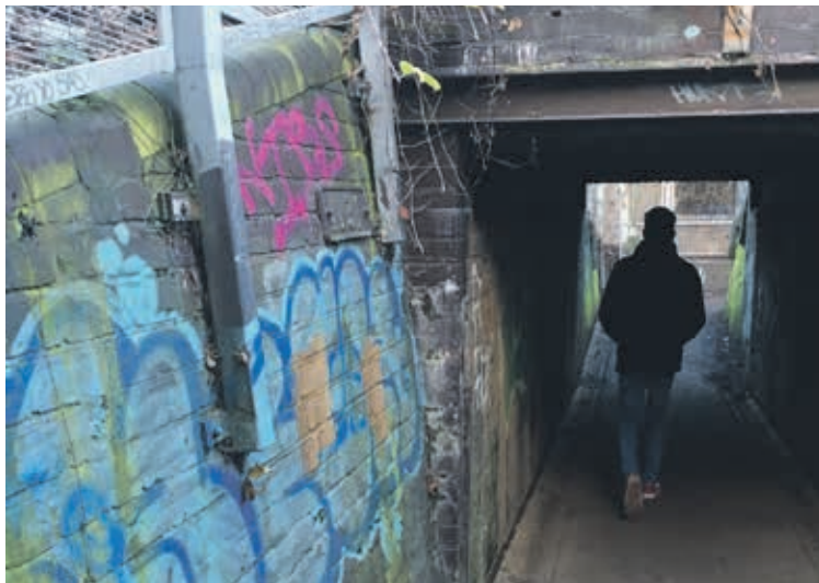
Unsafe passage: The underpass as it is now.

the residents at either end. It's a bit of a forgotten corner but there's a real determination to transform it."