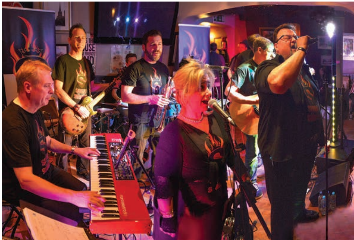
Sound of the Suburb play to a packed house at Maddens.