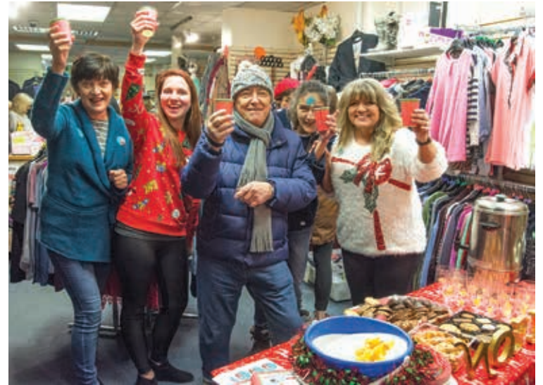
Christmas Cheer at the RSPCA shop.

Above right: The Holy Trinity Choir sing carols.