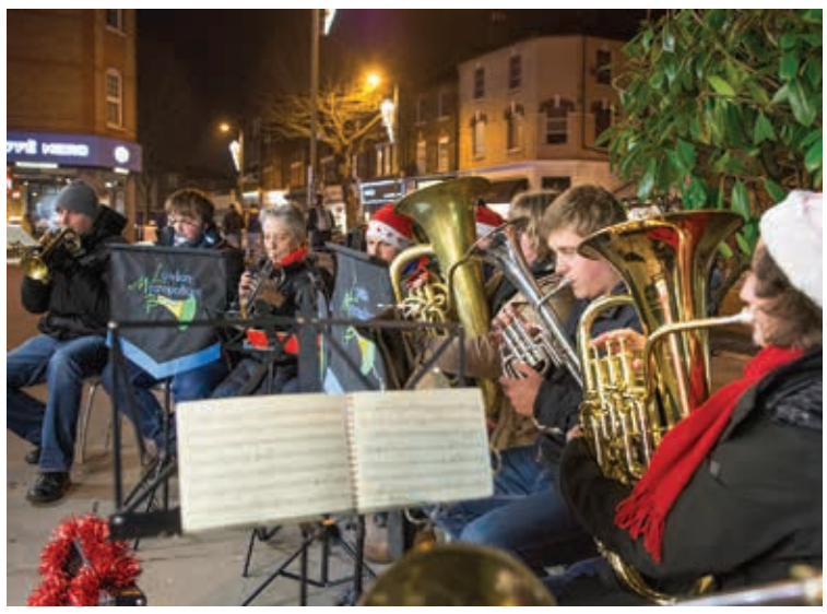
The London Metropolitan Brass Band.