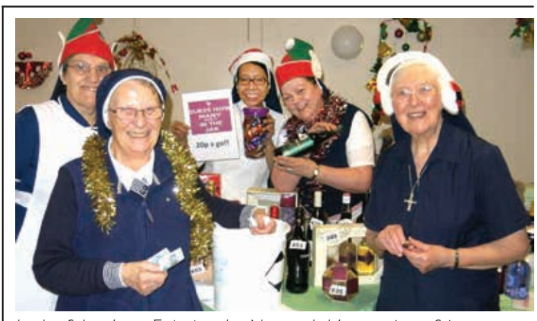
Luck of the draw: Enjoying the Nazareth House winter fair.

businesses are again invited and encouraged to participate. More details can be found at www. n2united.co.uk.