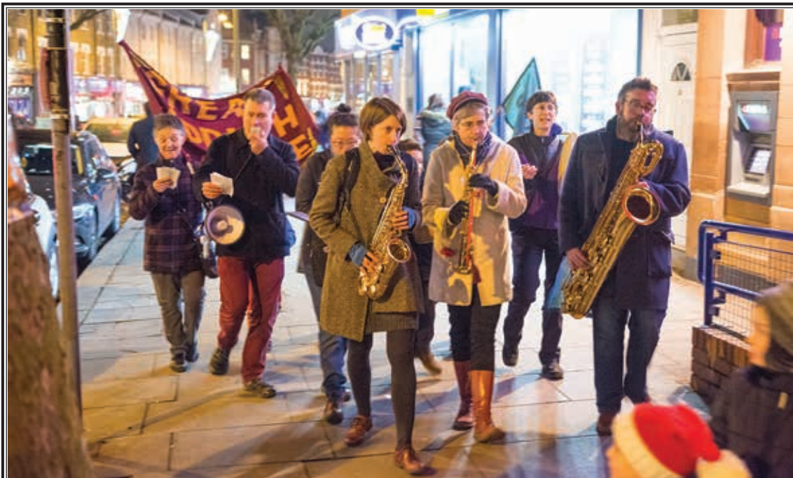
Band on the run: The Yiddish marching band provided a mobile musical experience moving in and out of stores at East Finchley's late night shopping event in December. Turn to page 6 for more photos from the event.

A community newspaper for East Finchley run entirely by volunteers.