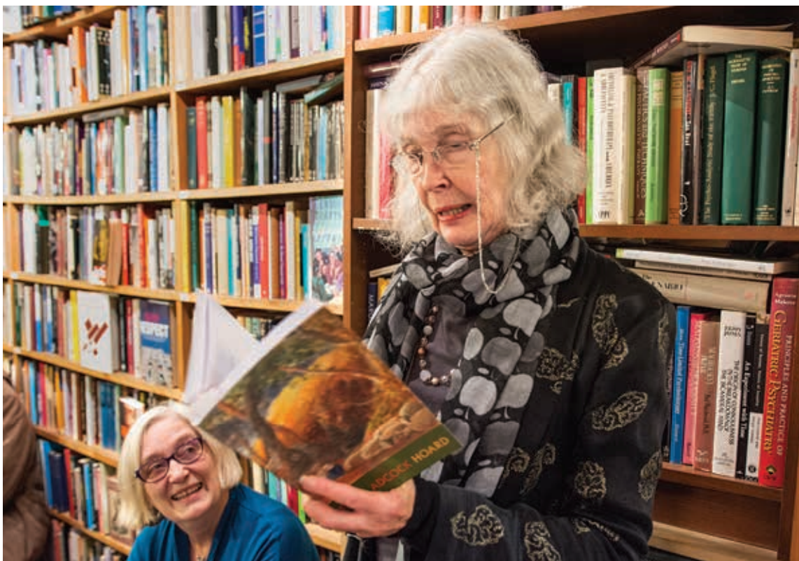
Fleur Adcock reads from her latest collection at the Black Gull Bookshop.