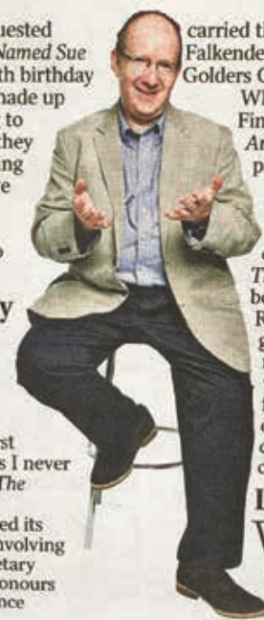
Cutting: Finkelstein's column

While queuing to pay at a petrol station this week, a man called out to me: "Your