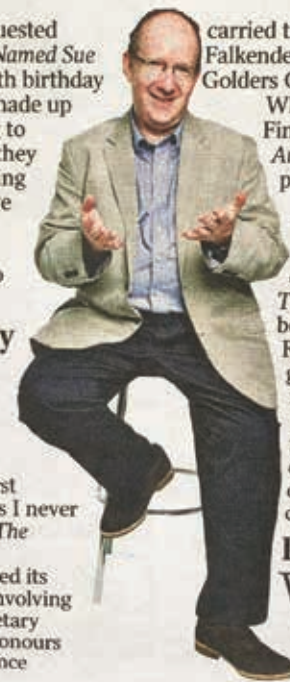
Cutting: Finkelstein's column

While queuing to pay at a petrol station this week, a man called out to me: "Your