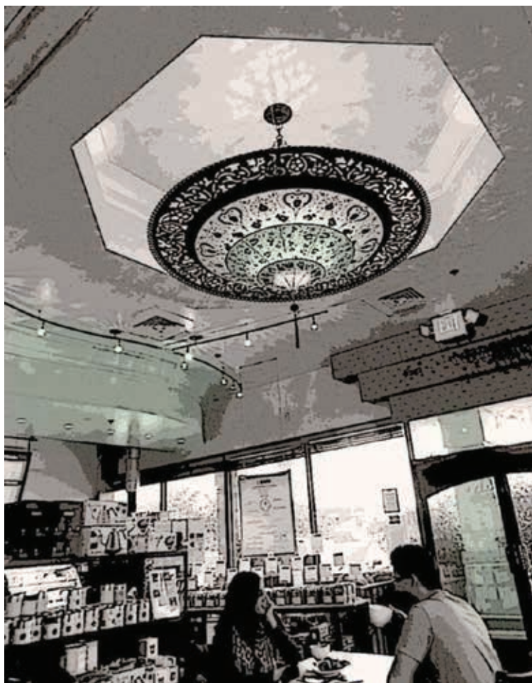
Café Life in Irvine, California