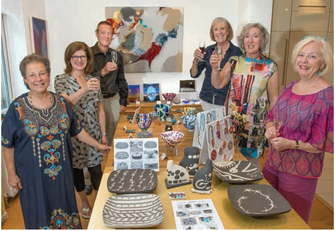
Some of the East Finchley Artists and their work.

https://www.facebook.com/teddybearsmusicclub https://www.facebook.com/SteppingStonesEastFinchley or text 07836 284538